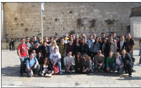
Birthright group at the Kotel